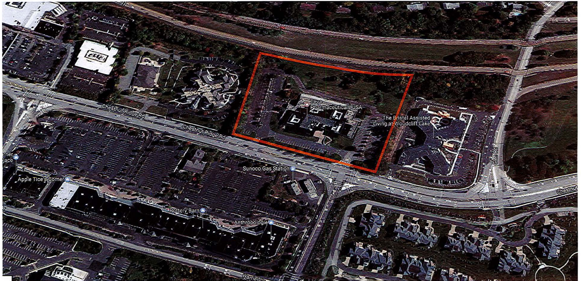
FIGURE 2: TEVA OFFICE BUILDING Proposed Age-Restricted Overlay Zone to Permit 100 Units Including 15-20 Affordable Units