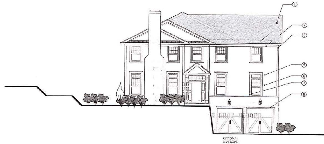
SIDE ELEVATION (typical)