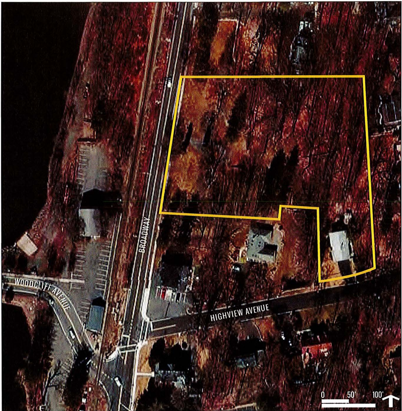
FIGURE 1: 230 NORTH BROADWAY Site of Proposed Borough-Sponsored 16-Unit Affordable Family Rental Project